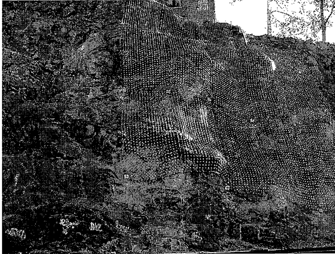
Scarborough Manor, N.Y.